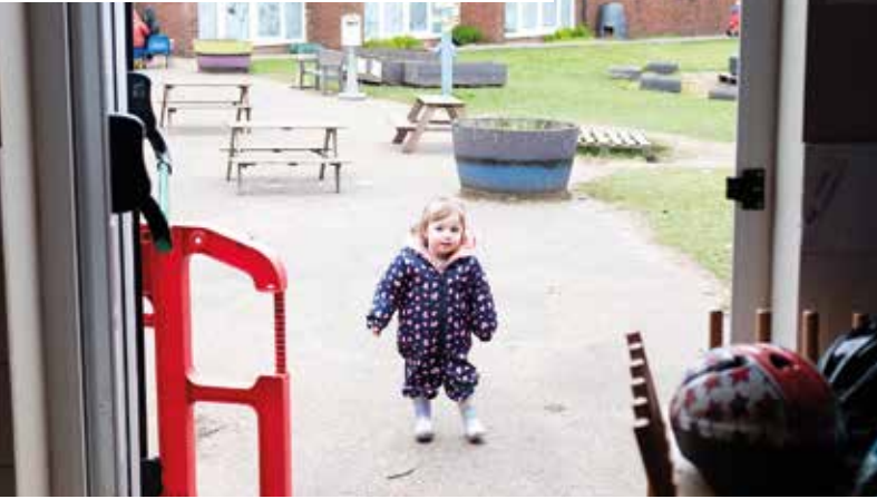
Into the boot room