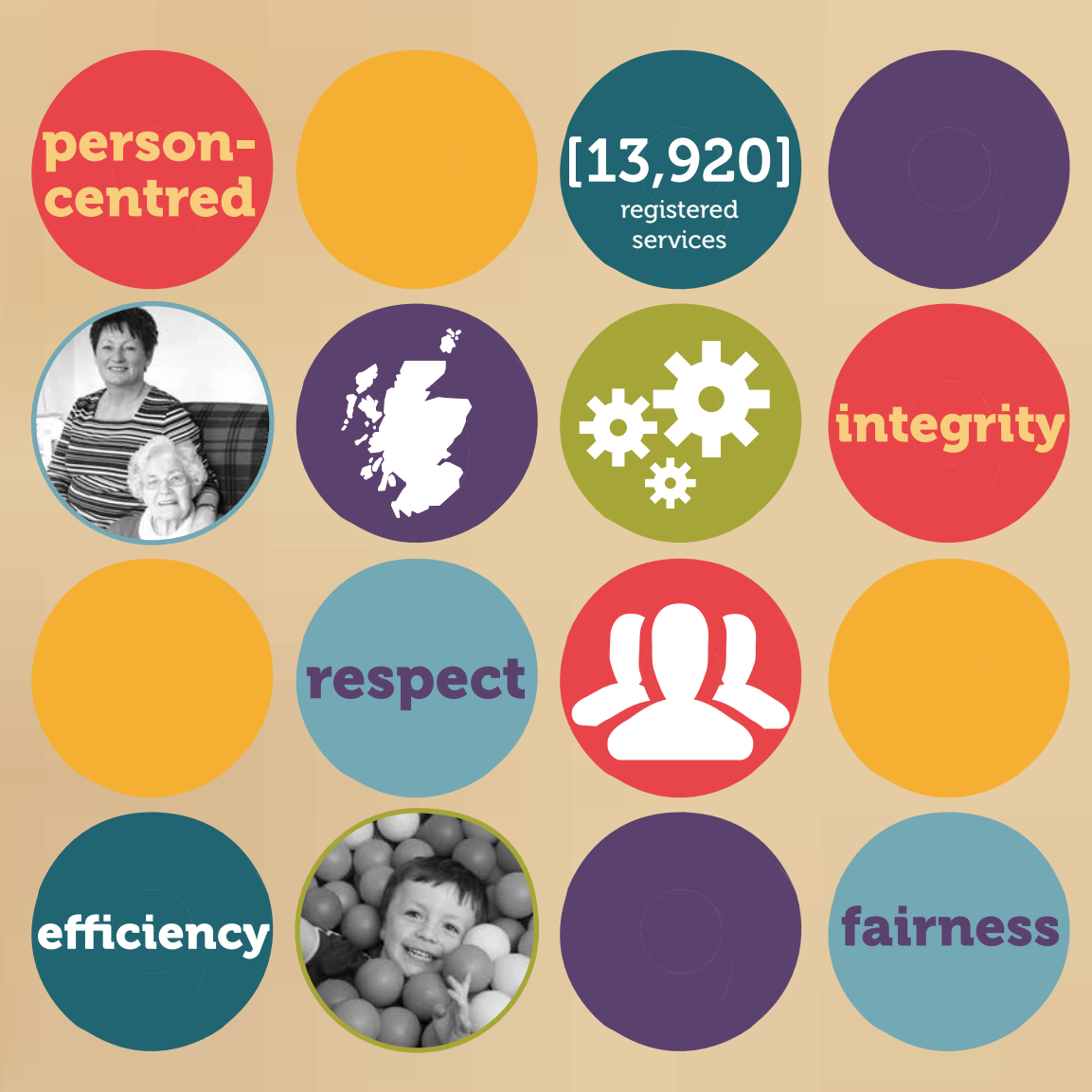
REVISED CORPORATE PLAN 2016—18 of the Care Inspectorate, formally Social Care and Social Work Improvement Scotland